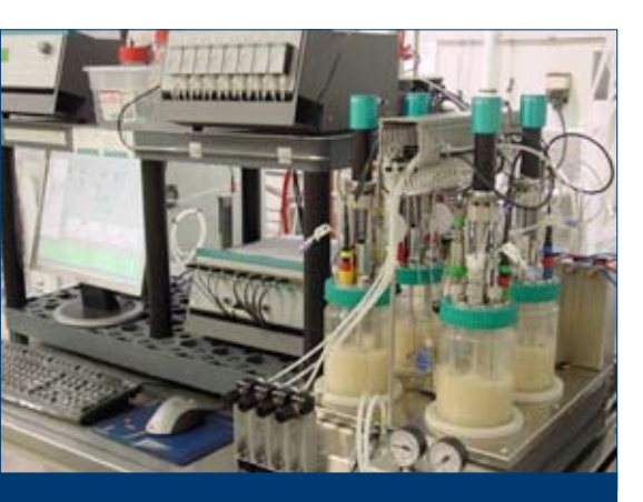
Figure 1. DASGIP system for biomass and protein optimisation and reaction engineering.

The use of plants, and especially crops, as a source of raw materials is controversial. Critics maintain that it drives